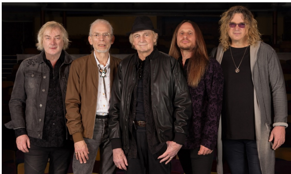
YES (L-R): Geoff Downes, Steve Howe, Alan White, Jon Davison, Billy Sherwood